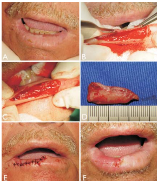
FIGURE 1 – A) Image showing initial appearance with whitened plaques with rough surfaces and undefined borders on the lower lip vermilion border. B) Image showing excision to a depth of approximately 2 millimeters. C) Image showing surgical wound after vermilionectomy. D) Tissue fragment removed. E) Single-stitch sutures. F) Clinical image at suture removal, 7 days after surgery.

Postoperative medications prescribed were 500mg Amoxycillin every 8h for 7 days, 1g Dipyron every 6h for 3 days, wound hygiene with 0.9% saline solution and application of Bepantol Derma® to the wound at night, in addition to the routine care provided to surgical outpatients.