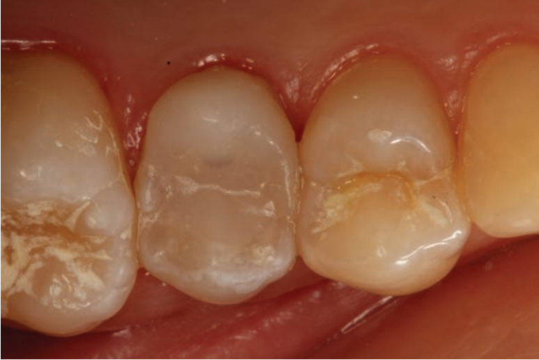
FIGURE 6 – Reconstruction complete