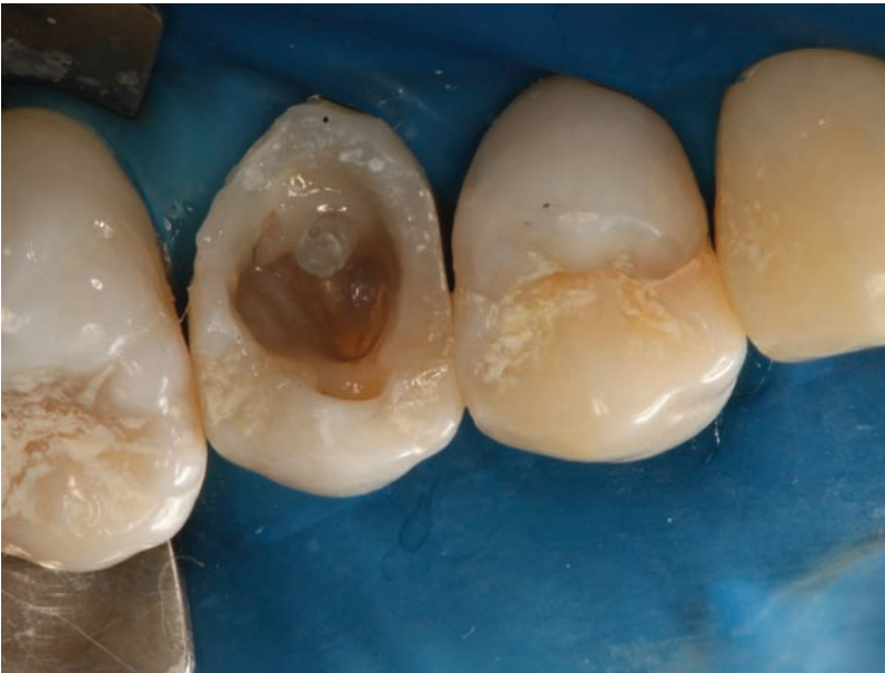
FIGURE 5 – Fiberglass post cemented in place.