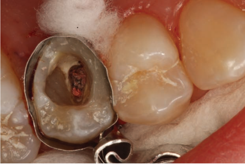
FIGURE 4 – Mesial wall reconstruction underway.