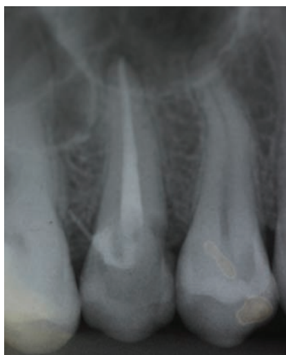
FIGURE 1 – Radiograph showing lateral perforation.

A 21-year-old woman presented for restoration of a right maxillary second premolar after endodontic treatment. Radiographic examination showed satisfactory obturation of the root canal system, but also revealed a root perforation in the distocervical region (Figure 1).