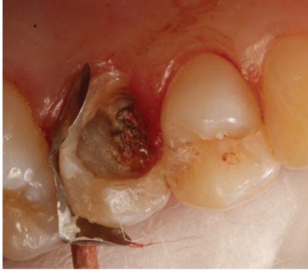
FIGURE 2 – Appearance after placement of glass ionomer cement.