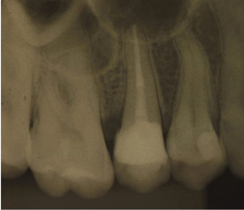
FIGURE 8 – Control radiograph at 2-year follow-up.

One week later, the patient returned for further restoration. First, a circumferential retainerless matrix device (AutoMatrix, TDV) was placed and the mesial wall of the tooth reconstructed with composite resin to facilitate rubber dam placement and improve the effectiveness of isolation for later stages of the restoration process (Figure 4). A temporary filling was placed (Coltosol, Vigodent S/A Ind. e Com., Bonsucesso, RJ, Brazil) and the patient sent home.