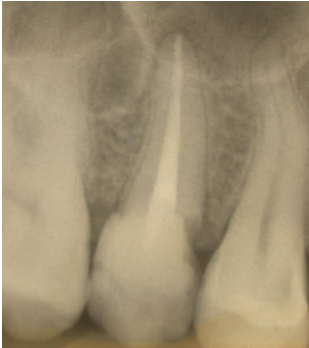
FIGURE 3 – Radiograph showing sealed perforation.