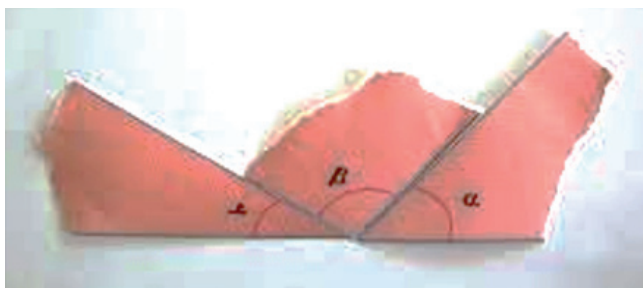
Figure 3. Material used to demonstrate that the sum of the internal angles of any triangle is equal to two right angles ( www.laboratoriosustentaveldematematica.com ).

A didactic material related to the principle of visualization adopted in the tachymeter method and which can still be found in contemporary textbooks and in the teaching practices of mathematics teachers consists of using cardboard cut-outs and illustrations on a sheet of paper to show the student, in a visual way, that the sum of the internal angles of any triangle is equal to two right angles. Figure 3 illustrates the presence of this type of material at present, although in an articulated way with the deductive reasoning of geometric properties.